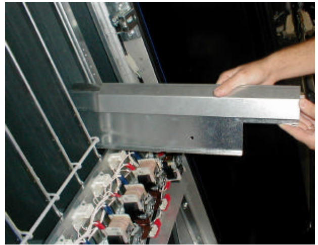
Figure 2 Can Shim Installation