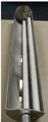
Figure 5 609,070,30x.x3 Rod & Spring Assembly 801,903,24x.x1 White Tube