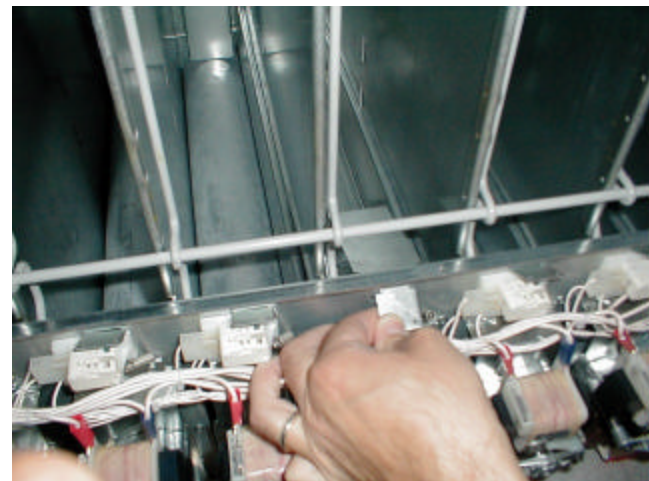
Figure 6 1 - 432,070,17x.x3 Narrow Column Sold-Out Paddle